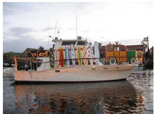
SGYC Holiday Boat Entry won "Best Yacht Club" entry